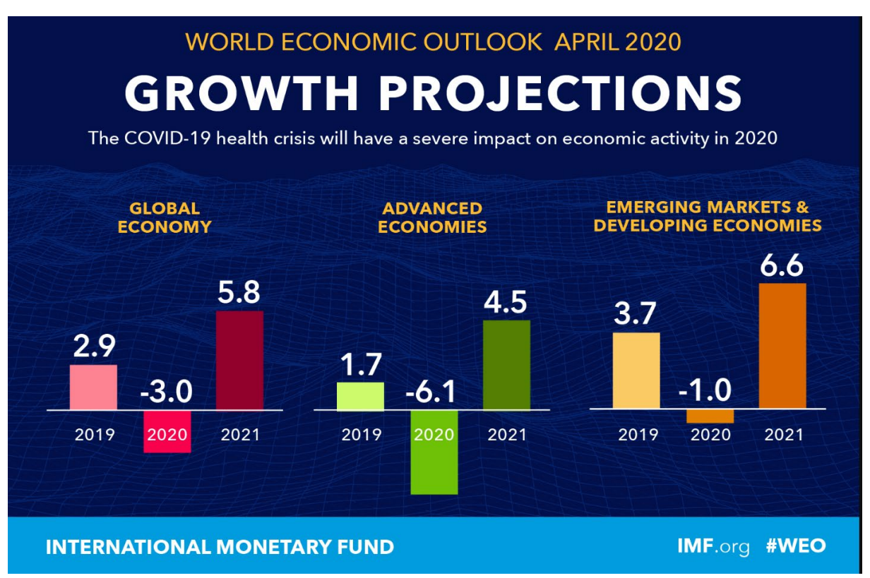
Graph from IMF - International Monetary Fund, from the article World Economic Outlook, April 2020: The Great Lockdown, link here.

Analysts are overall in agreement that a global historic recession in the range of -2 to -5 % is to be expected in 2020. However, with a global economy that was supported by a number of healthy fundamentals ahead of the crisis, there is a big belief that 2021 will see a healthy increase in GDP estimated to be around 4-6 % marking a full rebound. This driven by consumer spending expected to return once the lockdown situation is over, as evidenced below in the latest IMF growth projection.