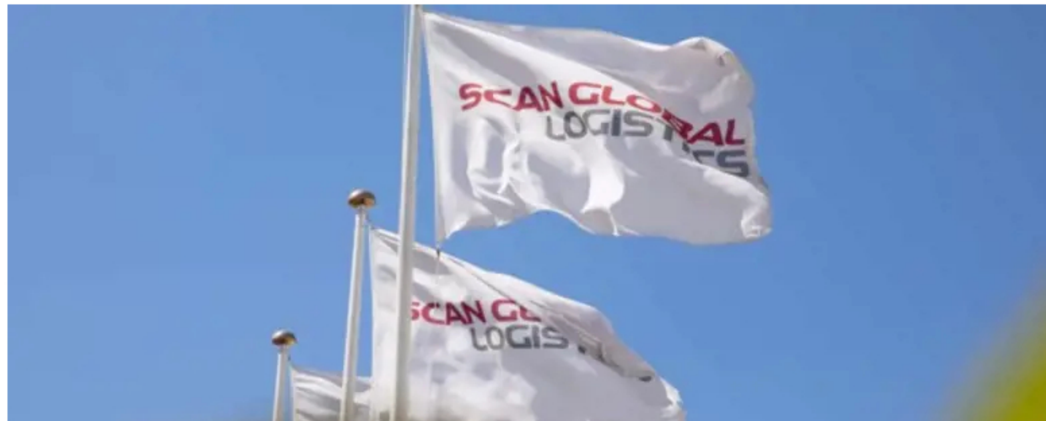
Photo of Scan Global Logistic flags.

As one of the first international companies to take advantage of the no-local sponsor regulation, Scandinavian-based Scan Global Logistics sets up its first wholly-owned business in Dubai, with more offices already in the pipeline.